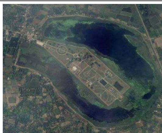
Fig. 1. Map of the Study Area.

Motijheel Lake is a scenic horse shoe shaped fresh water lake, which was excavated by Nawazesh Mohammad. The jheel was famous for raising golden tinted pearls from Unio margaitifera species. The lake is located between 24.9'12" to 24.9'42" N and 88.16'33" to 88.16'13"E, 7 km north of Berhampore town in the Murshidabad district of West Bengal, India (Fig.1).