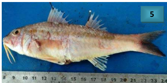
Fig.5: Upeneus sundaicus ( Bleeker, 1855), Ochre – banded goatfish.

D: VIII+I,8; A: I,7 ; P: 15 ; V: I,5 ; GR:22 ; LL:32; Body elongate, depth 3.75 times in standard length. Chin with a pair of barbel which extending slightly beyond rear margin of preopercle, their length 1.68 times in head length. Proportion of eye diameter to head length is 4.47 and proportion of head length to standard length is 3.65 First dorsal spine very small. 4½ vertical rows of scale present in inter-dorsal space. Ventral fin almost equal to pectoral fin. Body greenish dorsally , yellowish white ventrally, with a brownish yellow stripe from eye to mid base of caudal fin. Dorsal fin yellowish with pale reddish base. Caudal fin brownish yellow, lower lobe of caudal fin with dusky posterior margin narrow towards the lobe. Barbell orange (Fig.5).