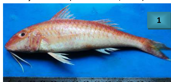
Fig. 1: Parupeneus heptacanthus (Lacepede, 1802), Cinnabar goatfish.

from Andhra Pradesh coast (Barman et al. , 2004); Tamilnadu coast (Krishnan et al. , 2000) and Gujurat coast (Barman et al. , 2000).