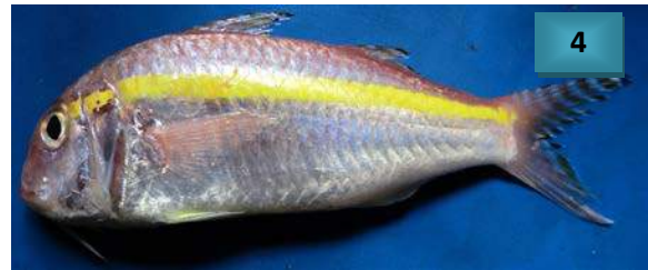
Fig.4: Upeneus moluccensis (Bleeker, 1855), Goldband goatfis.

D: VIII+9; A:I,7; P: 15; V: I, 5; GR: 27-29; LL: 33-36; Body elongate, depth 3.5 – 3.83 times in standard length. A pair of white to pink chin barbules not reaching to rear border of preopercle and 1.78-1.94 times in head length. Proportion of eye diameter to head length is 4.01 - 4.71 and proportion of head length to standard length is 3.24 - 3.75. Two dorsal fins widely separated by 5½ vertical rows of scale, the first dorsal spine very small.