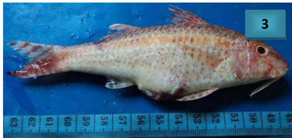
Fig.3: Upeneus luzonius Jordan and Seale, 1907, Dark-barred goatfish.

D: VIII+ I,8 ; A:I,6 ; P:14 ; V:I,5 ; GR: 23-25; LL: 29-30. Body elongate, depth 4.00-4.25 times in standard length. Chin with a pair of barble that extend posterior to rear border of preopercle, their length 1.38-1.48 times in head length. Proportion of eye diameter to head length is 3.51-3.93 and proportion of head length to standard length is 3.58-3.93. Two dorsal fin separated by 4½ vertical rows if scale, the first with 8 spine, first spine is very small. Pelvic fins slightly shorter than pectoral fins. Body brownish red, three saddle like broad dark bars present, first one below 1 st dorsal fin, second below second dorsal fin and the third one present on caudal peduncle. Both lobe of caudal fin contains 4 to 6 oblique dark bars, those of lower lobe more prominent (Fig. 3).