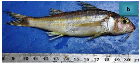
Fig.6: Upeneus taeniopterus (Cuvier, 1829) Fins tripe goatfish.